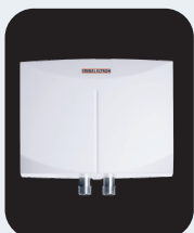
Tankless Electric Water Heaters