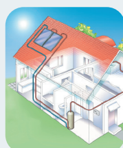
Solar Thermal Hot Water Systems