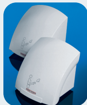
Galaxy™ Touchless Automatic Hand Dryers