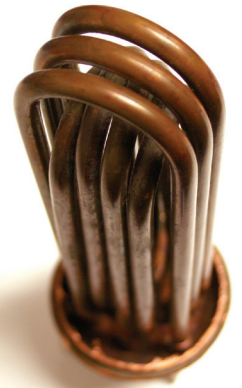
Copper heating element - exclusive to Stiebel Eltron!

* Single unit, switchable between 7.2 kW and 9.6 kW at installation via jumper